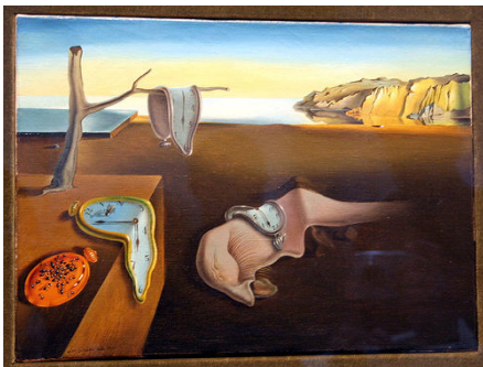
The Persistence of Memory