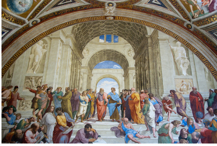
School of Athens