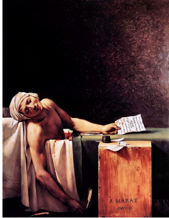
The Death of Marat