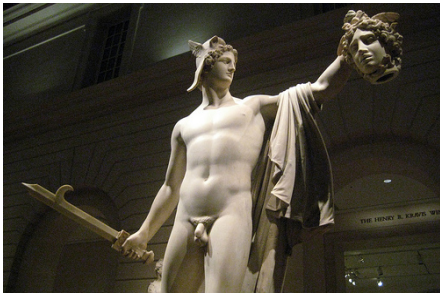
Perseus With the Head of Medusa